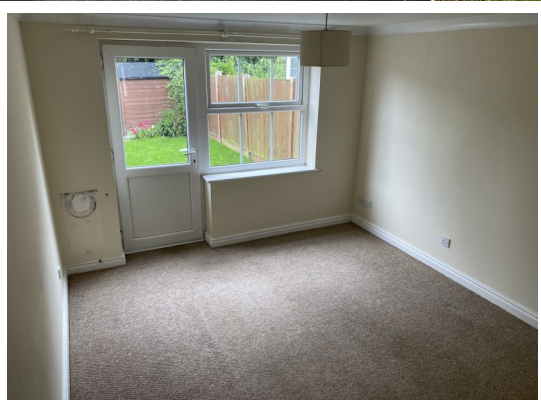
54 Holm Drive, Elton, Chester, Cheshire, CH2 4RJ